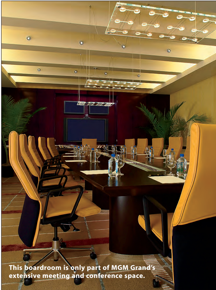
This boardroom is only part of MGM Grand's extensive meeting and conference space.