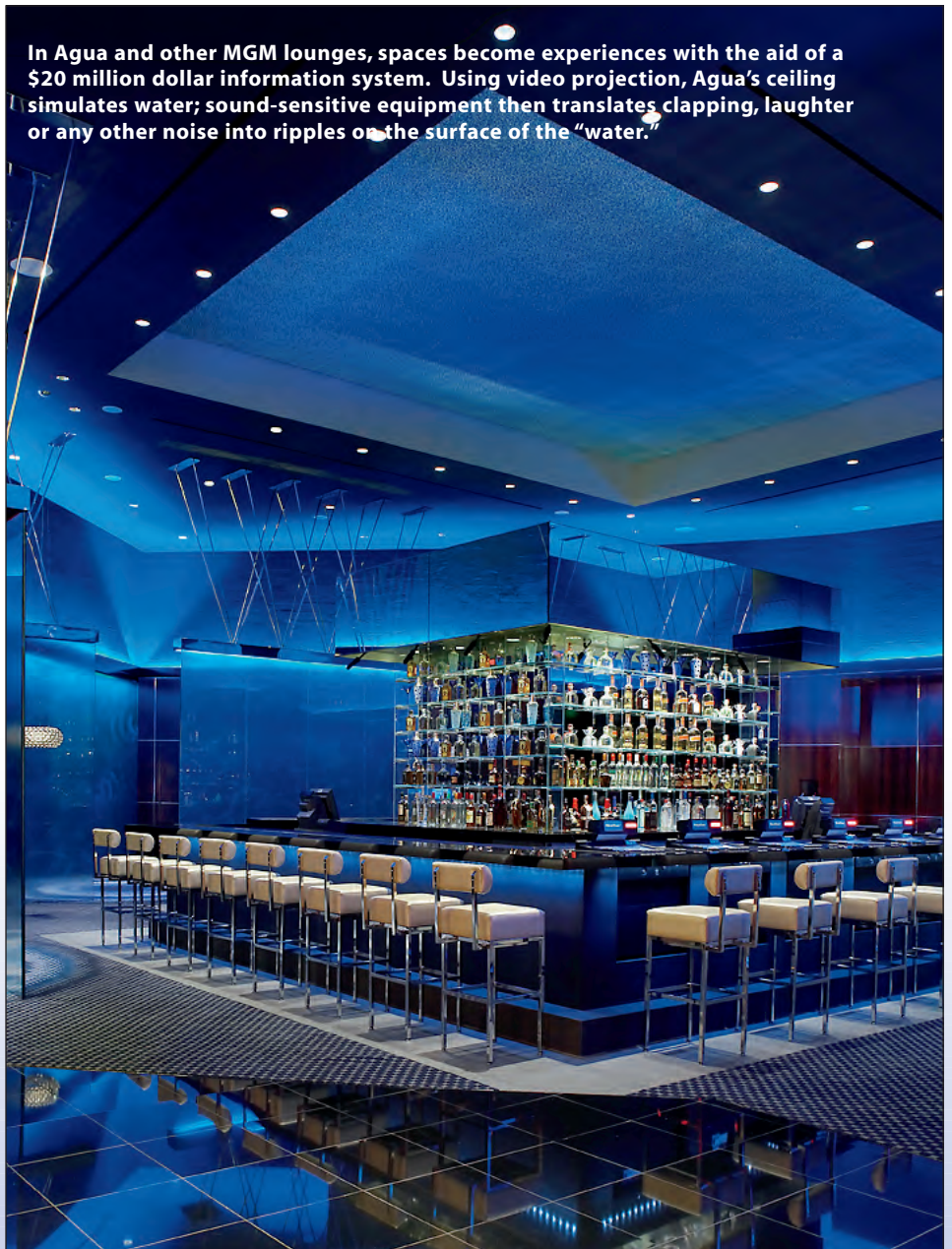
In Agua and other MGM lounges, spaces become experiences with the aid of a $20 million dollar information system. Using video projection, Agua's ceiling simulates water; sound-sensitive equipment then translates clapping, laughter or any other noise into ripples on the surface of the "water."

but all clad in a sophisticated interplay of inspired finishes. At MGM Grand Detroit, everyone can follow his or her own bliss, whether its floating like a lotus petal in the pool of the incomparably lovely IMMERSE Spa or ramping up your relaxation levels in the "night fever" of the award-winning V lounge. Water and fire, serenity and excitement are all under one roof in this destination entertainment complex housing a 400-room hotel, 9,000 square feet of nightclub space in six different lounges, 6,000 square feet of retail, an 18,000-square-foot resort spa for both hotel guests and day visitors, and a