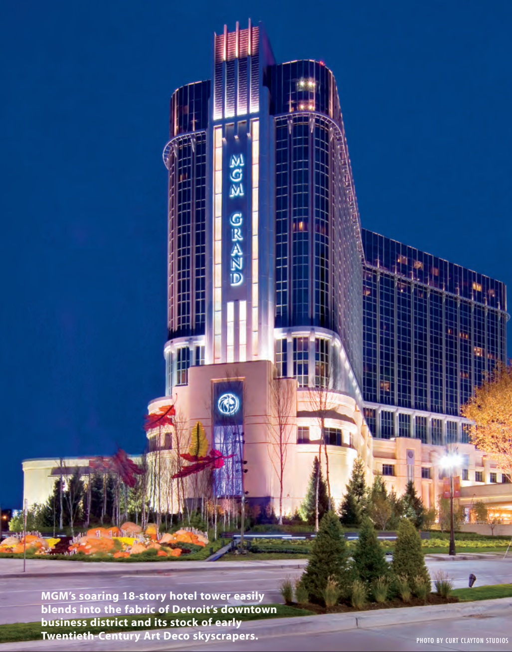
MGM's soaring 18-story hotel tower easily blends into the fabric of Detroit's downtown business district and its stock of early Twentieth-Century Art Deco skyscrapers.